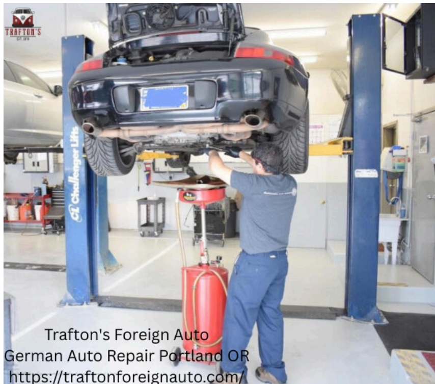
Trafton's Foreign Auto German Auto Repair Portland OR https://traftonforeignauto.com/

For homeowners who're nevertheless evaluating recommendations, Portland affords at the very least a couple of verified touchpoints. A & P Specialties offers itself as a German restoration shop serving Audi, BMW, Porsche, and Volkswagen vendors and has been in business for over 27 years. German Formula Auto Repair is indexed with over 40 years of adventure and carrier for those comparable four manufacturers, such as other European makes. Volkswagen house owners exploring network possibilities may magnify the RepairPal Certified framework, including the minimum 12-month, 12,000-mile limited warranty and 30-day Fair Price Guarantee defined for Portland-edge VW repair retailers on that community.