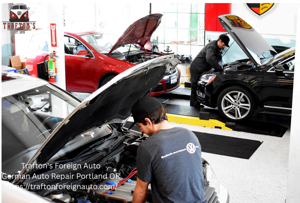
Trafton's Foreign Auto German Auto Repair Portland OR https://traftonforeignauto.com/

A very good German provider shop will in the main dialogue with you approximately present day demands and near-future wishes within the identical dialog. That mindset can suppose greater based than what some drivers are used to at a common restoration facility. It isn't about upselling for its own sake. It is about recognizing that these automobiles in the main praise planned service and punish deferred carrier.